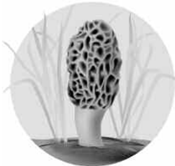
Illustration by Julie Ridge

Non-Profit Org. U.S. Postage PAID St. Louis, MO Permit No. 1197